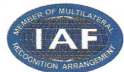
Vice President - AJA Registrars Inc.

This schedule and the certificate it accompanies remain as a property of AJA Registrars Inc. and must not be altered or defaced in anyway. They must not be copied in whole or in part without the written permission of the Vice President of AJA Registrars Inc. Deliberate misuse of the certificate or schedule will result in cancellation without notification.